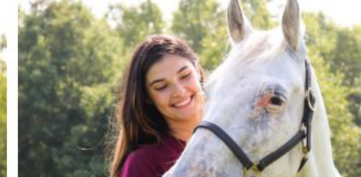
21-year-old Appaloosa gelding, 14.3hh

Adam is a big puppy dog in a horse's body. This handsome fellow is non-rideable due to an old injury, but is pasture sound and looking for a companion-only home. Adam gets along well with other horses and is currently living outside 24/7. Adam is very personable, loving, and enjoys all the attention he can get. He would be the perfect addition to any herd.